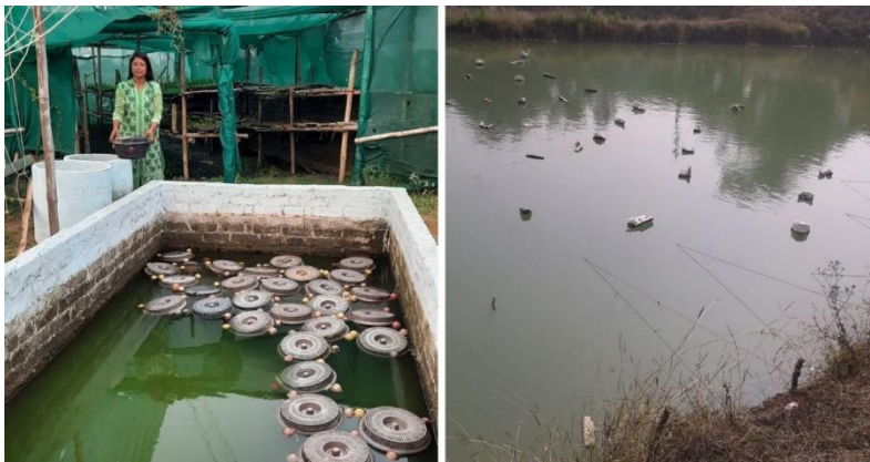
Figure 2 Pond Culture of Pearl farming in India (Source: The Better India, 2021) .

India Freshwater mussel is implanted to pearl culture year-round except during the hot months of May-June to reduce post-operative mortality and nucleus rejection. Traditional culture ponds are the most suitable since they are approximately 2.5 meters in depth, have a clay-soil foundation, are slightly alkaline and lack algae blooms and aquatic weeds. Implanted mussels are placed on bamboo rafts of nylon mesh bags (30 × 13 cm, 1.5 cm mesh) at a density of 50 000 mussels/ha (Figure 2).