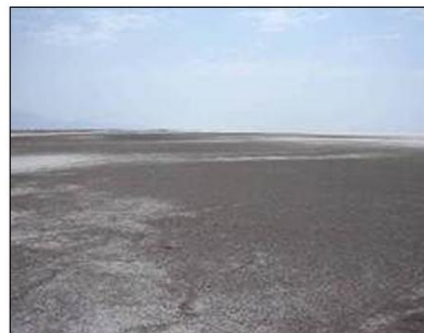
Figure 3 The mud flat and erosive terrace with alluvial sediments in coastal parts of Tasooj