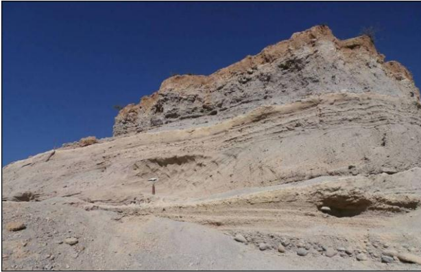
Figure 5 the sedimentary terrace belonged to upper Pleistocene located in 6 km of Urmia northeast (Ghahramanloo region)

Pleistocene sedimentary terraces have been formed at their southern margins (Figure 5). As a result on the base of field studies the most important geological types of Urmia lake coastal areas are as follows: the erosive river sedimentary terraces, the vertical erosional cliffs, the sedimentary terraces produced due to water level fluctuations of Urmia Lake, erosional channels, cliffed and sandy coasts, mud flats and salt marshes. The Urmia lake coastal areas are divided in to several classes in aspect of morphological structure: very low slope and raised mud flats of eastern and southern parts (Islami island – Miandoab), the steep cliffed rocky coasts of northwest (Ghalghachi – GovarchinGhaleh) and southeast (Ajabshir–Maragheh), sandy alluvial beaches in subsiding central north parts (ShahidKalantari causeway), raised zones of central south parts (islands) with detrio clastic, carbonate and salt materials. Also, various sedimentary environments have been shaped at the above morphological units such as: river estuaries (Aji Chai river: the eastern part, Siminehrood and Zarrinehrood rivers: southern parts), wetlands and marginal marshes (containing brackish to fresh water) mostly located in southeast and southwest parts, lake (central part up to northeast), playas (the overlooking coastal to southern region of Ajichai estuary and Tasoojcoastal area) and salt marshes (the Ajichai estuary and western part of Islami island).