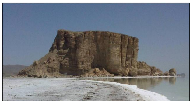
Figure 4 the erosion cliffed coasts in northwest of Urmia Lake (Govarchin Ghaleh region)